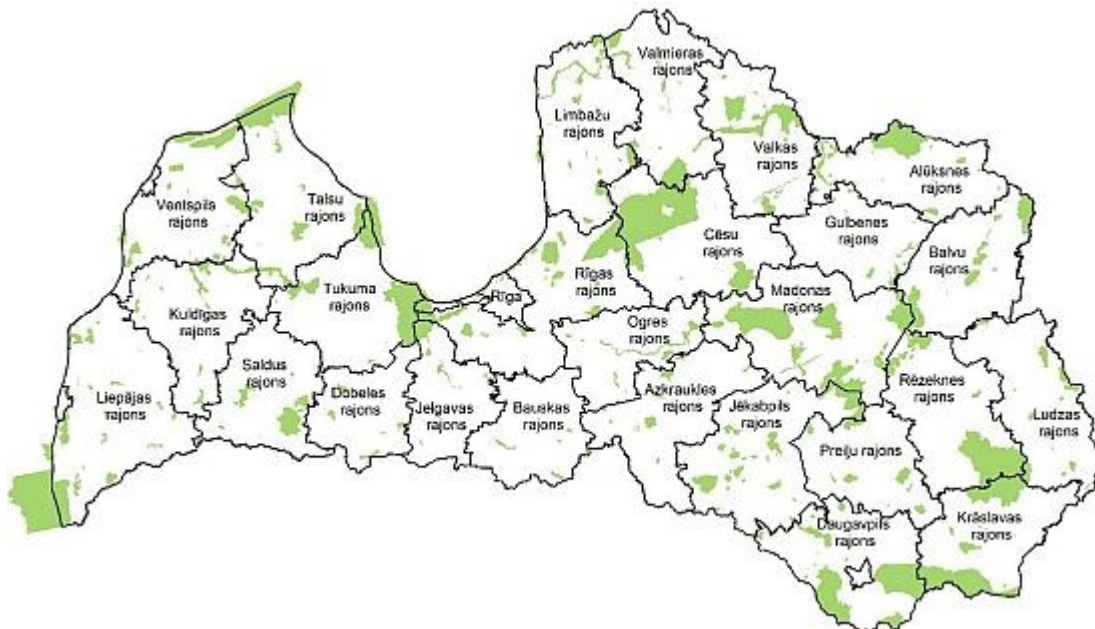
Picture 2. The NATURA 2000 sites in Latvia marked green.